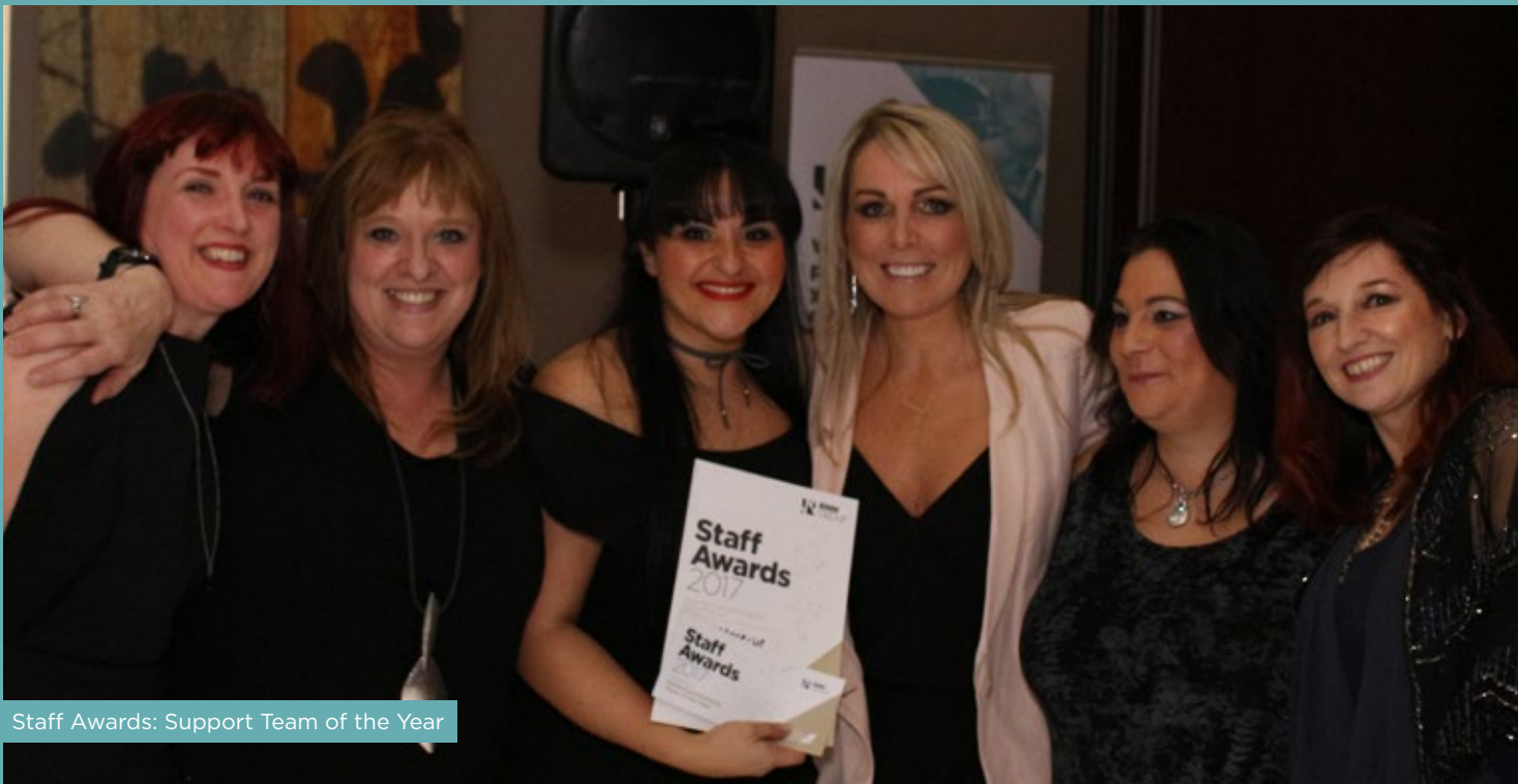
Staff Awards: Support Team of the Year