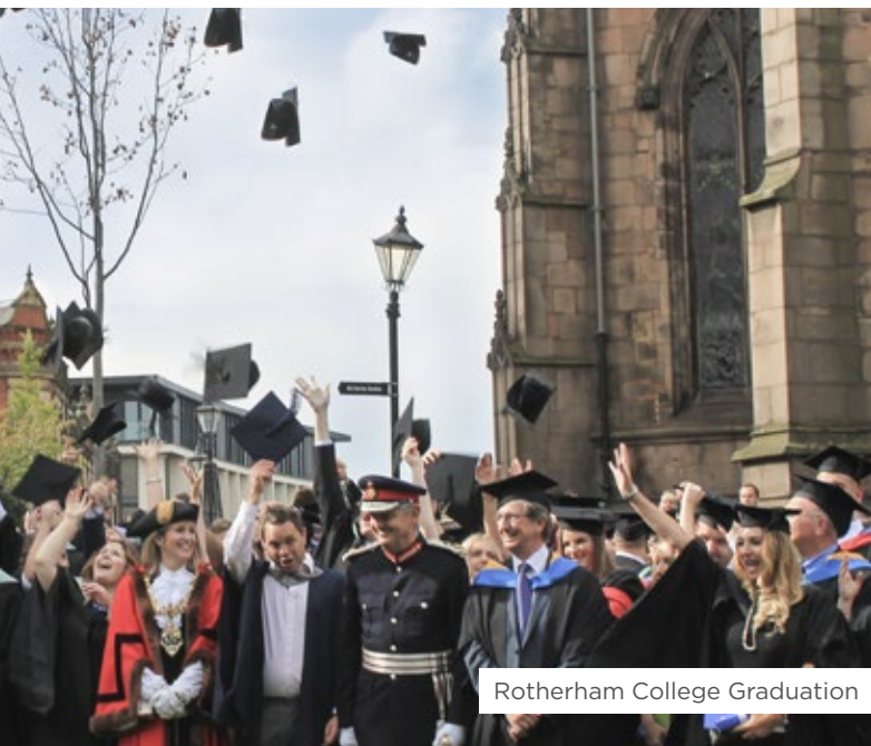
Rotherham College Graduation