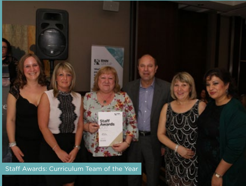
Staff Awards: Curriculum Team of the Year