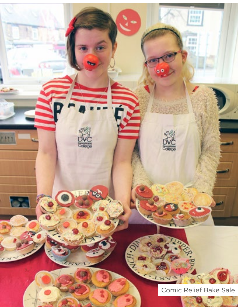
Comic Relief Bake Sale

A class of construction students put their new skills to the test, in a project that saw them refurbish a disused area of Prospect Hill Infant and Nursery School's playground to create an outdoor stage to host children's performances. The project not only benefitted the children, but allowed the students to put their knowledge to use whilst gaining fantastic experience for their course.