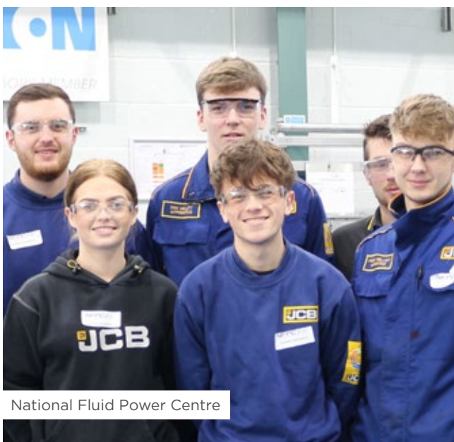
National Fluid Power Centre

RNN Group subsidiary training provider, Create Skills, is celebrating a successful partnership that has led to the growth of web and digital firm, Express Group's workforce. Create Skills has now recruited four Apprentices for the Yorkshire-based printer repair and parts company, for various Apprenticeship roles including Business Administration and IT. All four of the Apprentices recruited and trained by Create Skills have since secured themselves permanent roles at the Express Group, growing the company's workforce with specially-trained young talent.